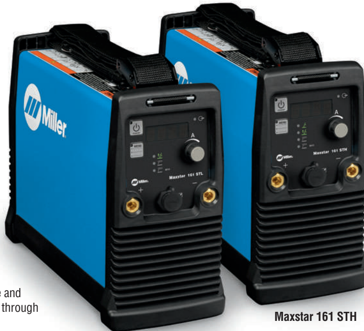
Maxstar 161 STL

Built-in gas solenoid eliminates the need for a bulky torch with a gas valve.